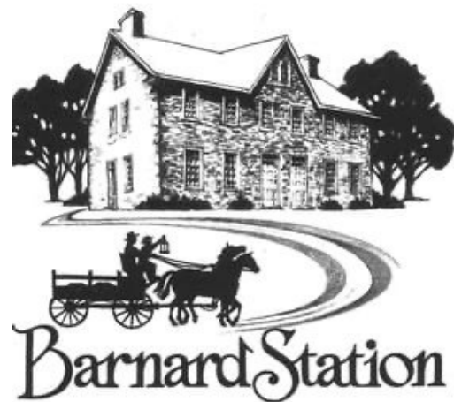
Barnard Station Logo