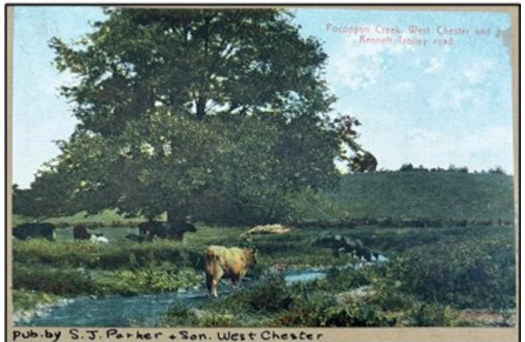
Figure 11: "Pocopson Creek, West Chester and Kennett Trolley Road."

Postcards advertised a “beautiful scenic ride over picturesque and historic country hills and dales.”