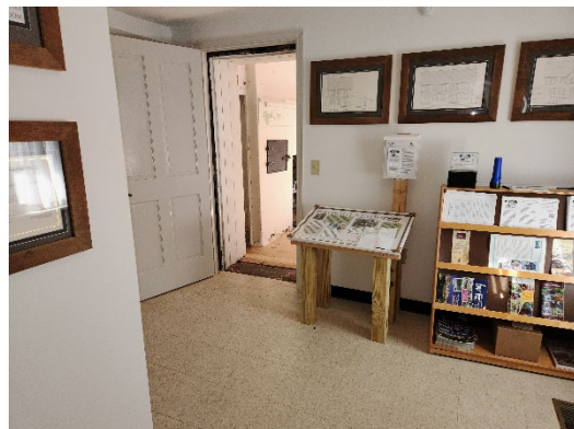
Today the Taylor building is used for the Visitors Center and bathroom.