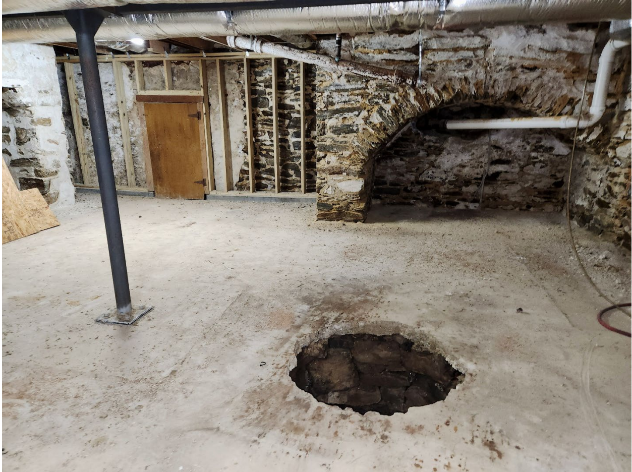
The well is in the basement and has been mostly filled with stone.