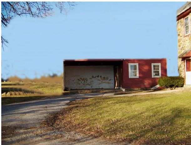
The unattached Taylor building was incorporated into the household in 1841 during the expansion with a door connecting to the new kitchen. A portion of the Taylor building was likely used as a keeping room (walk in pantry and food preparation area).